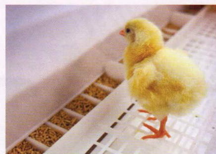
In the Cradles, the chicks have access to feed (above) and fresh water (below).

A total number of 22 Cradles are stacked